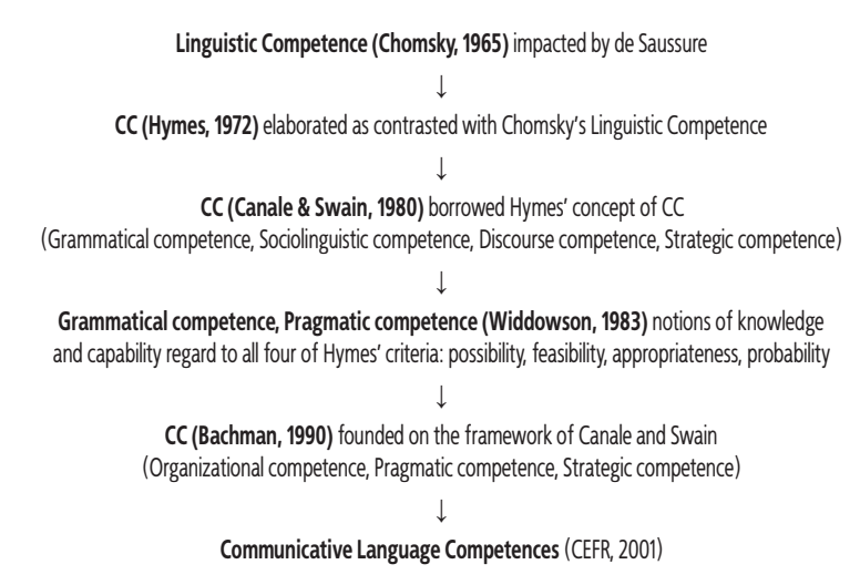
Figure 1. The chronological evolution of the linguistic research on communicative language competence.

A broad variety of theories and models is elaborated for the usage of "competence" as the concept in language teaching, internalization, assessment and in other fields of language research (Bachman, 1990; Botha, 1981; Canale, 1983; Canale & Swain, 1980; Chomsky, 1965; Hymes, 1972). A few of them are represented in Figure 1.